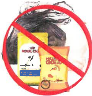
NO Plastic, Chip & Pet Food Bags