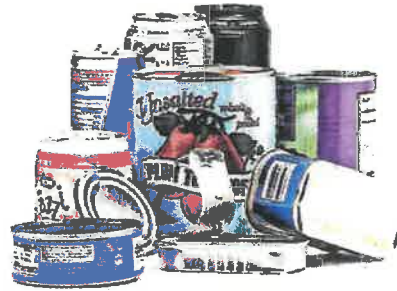
Aluminum, Tin & Steel Cans