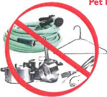
NO Garden Hoses, Hangers, or Kitchenware