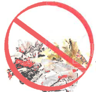
NO Soiled Paper