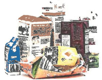
Dairy & Juice Cartons