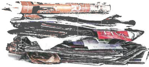
Clean Paper, Cardboard, Junk Mail, Newspapers, Phone Books & Magazines

FILL YOUR RECYCLING CART OR DUMPSTER WITH CLEAN RECYCLABLES