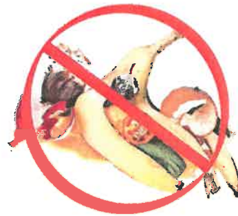
NO Food Waste